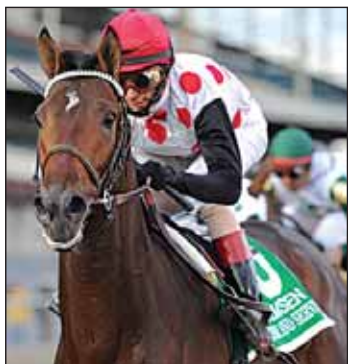
TO HONOR AND SERVE

On Monday, Norfolk Stakes (G1) winner Jaycito drilled seven furlongs in 1:24.80 handily at Hollywood Park in preparation for the San